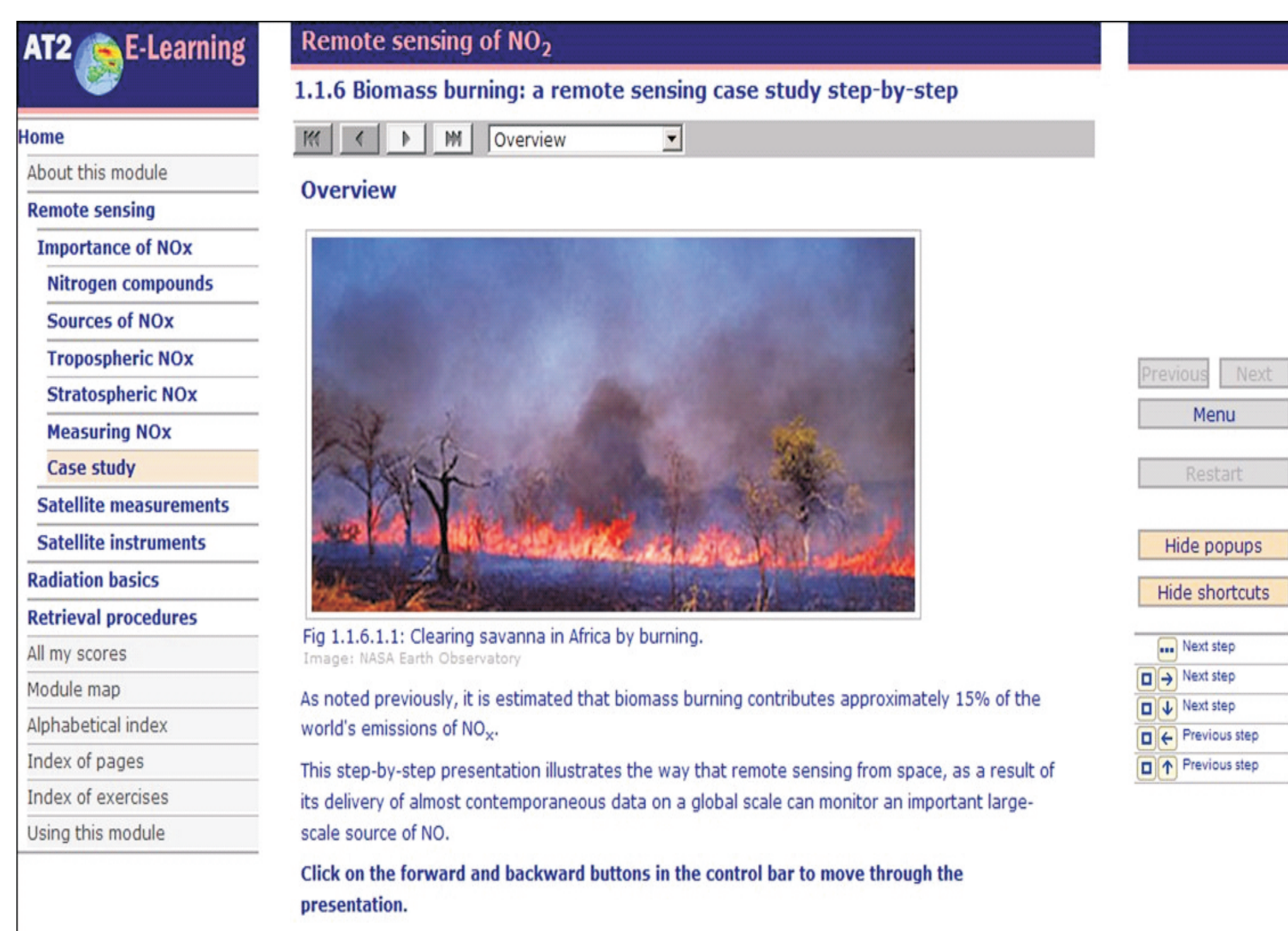
Fig. 2. The student is taken, step-by-step, through a case study of biomass burning, presented in terms of the emission and distribution of the trace gases \text{NO}_2 , \text{HCHO} , and \text{O}_3 , as observed by GOME [Ladstätter-Weissenmayer et al., 2005, Meyer-Arnek et al., 2005].

The first section on Remote Sensing deals with the importance of the nitrogen oxides, \text{NO}_x (= \text{NO} and \text{NO}_2 ) and the use of satellite instruments (GOME [Burrows et al., 1999] and SCIAMACHY [Bovensmann et al., 1999, Gottwald et al., 2006]) and remote sensing measurements. The satellite scanning concepts and techniques such as polar, near-polar and sun-synchronous orbits, swath, scan sequences, different observing modes such as nadir, limb and occultation mode and their measurement sequence and wavelength ranges are explained as well [Gottwald et al., 2006].