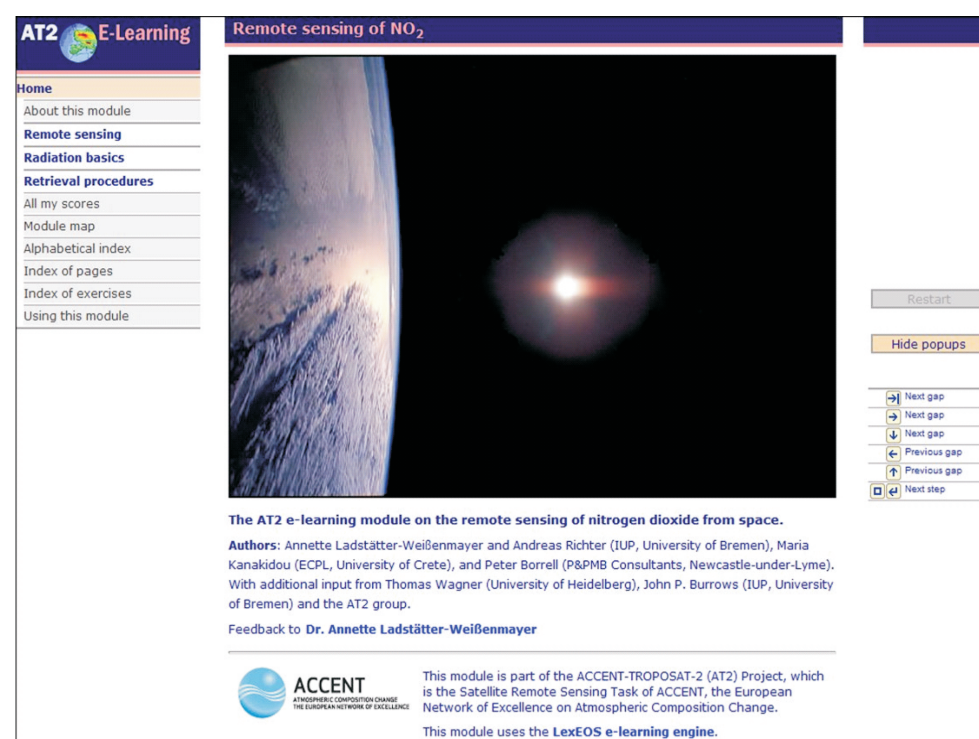
Fig. 1. Starting the AT2 e-learning module on "Remote Sensing of the Troposphere from Space"

Students on postgraduate level should be trained in using and analysing remote sensing data from both ground and satellite based instruments and/or in interpreting the high variety in remote sensing, e.g., satellite images or maps. Therefore an online e-learning module has been devised and constructed to facilitate the teaching of Remote Sensing of the Troposphere from Space to research students at Master's level.